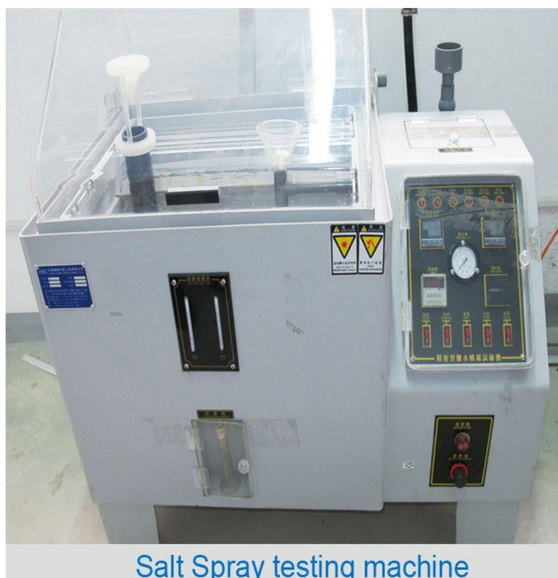
Salt Spray testing machine