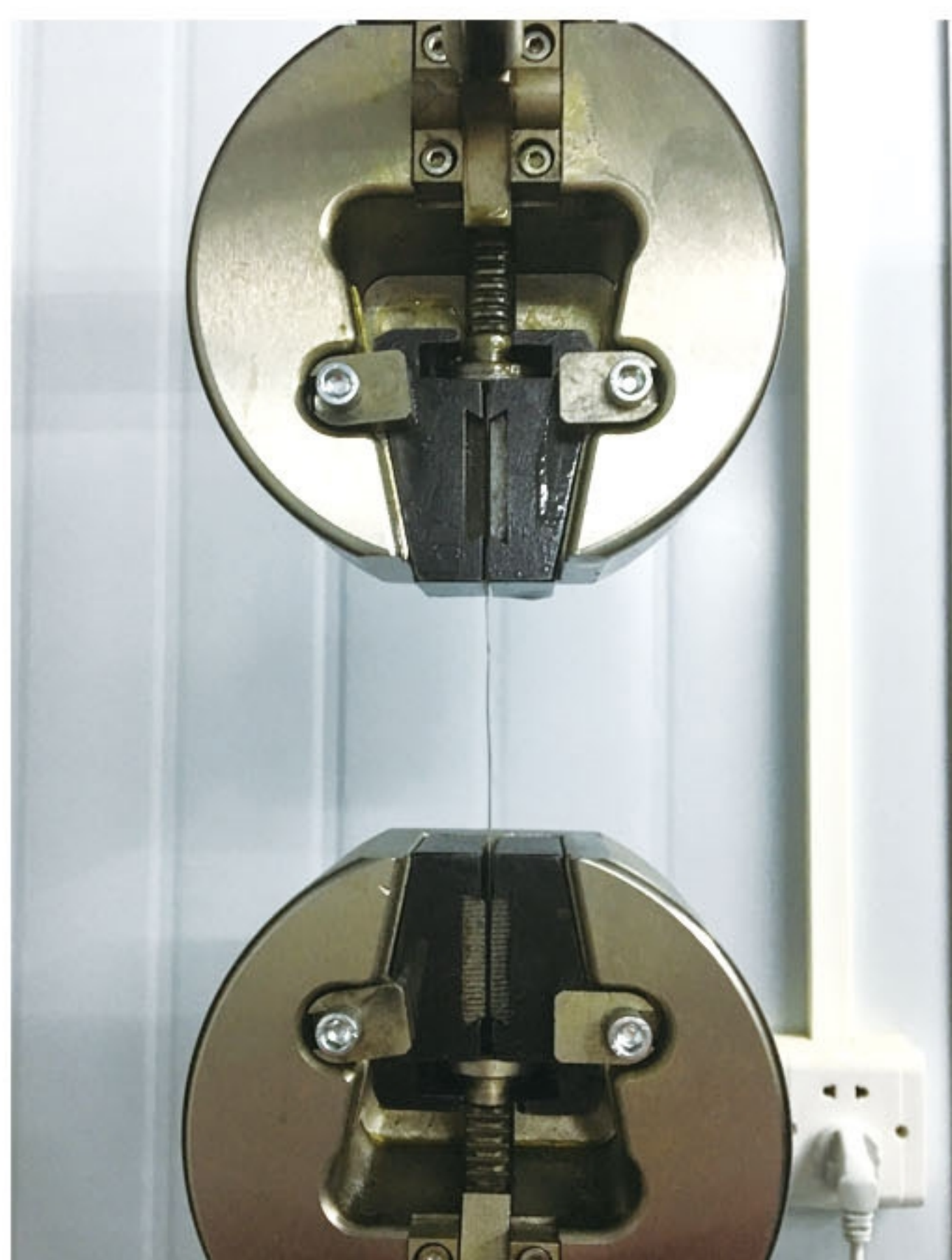
Tensile Strength Testing Machine