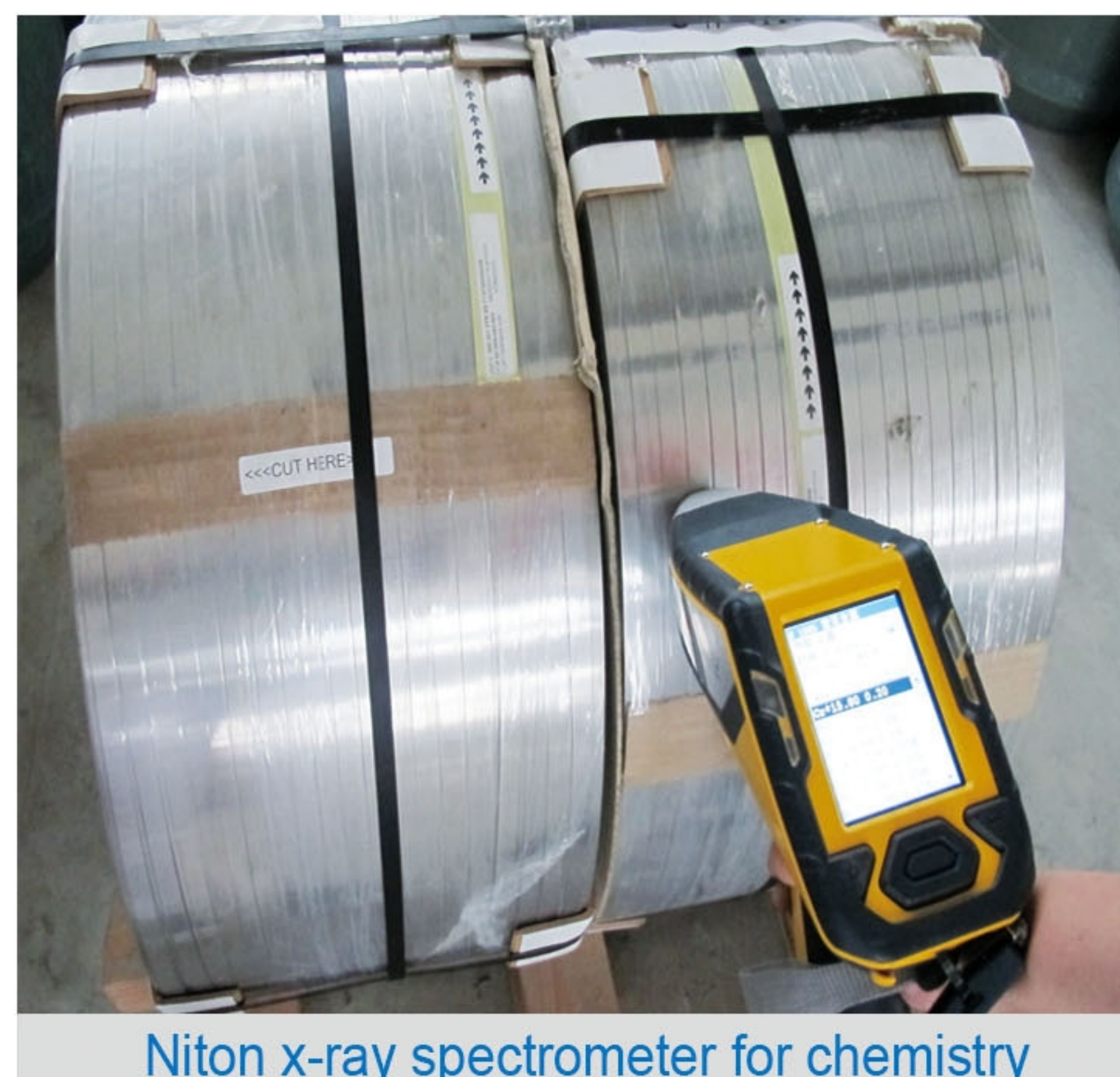
Niton x-ray spectrometer for chemistry